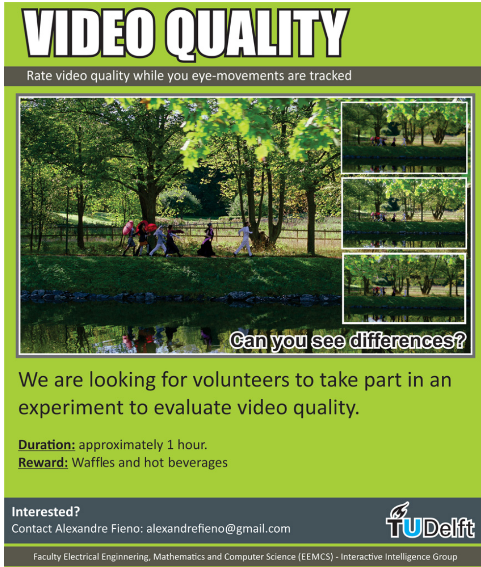
FIG. 2: Poster used for recruitment.