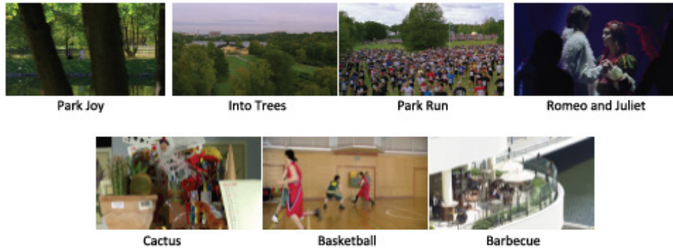
FIG. 1: Screenshots of the first frame of the sequences included in Experiment.

The video database used in this experiment was generated from seven high-definition videos (original videos) with 1280 \times 720 , 50 fps and 20 seconds duration and that correspond to a diverse content (Basketball, Romeo and Juliet, Park Run, Cactus, Park Joy, Barbecue and Into Trees), as depicted in Figure 1. From the original videos were generated several different degraded versions (more details can be seen in the subsection II B and in the tables I and II).